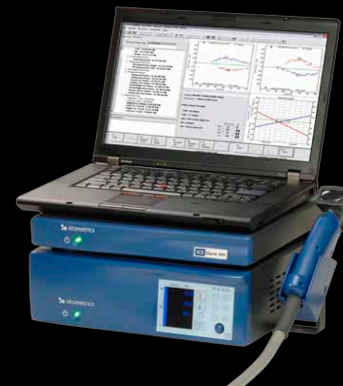
Small footprint - ICS AirCal stacked with Otometrics' VNG/ENG solution

Irrigation with the ICS AirCal provides a modern choice for gold standard caloric irrigation. It combines the convenience and patient comfort of air, with the precision of water irrigation, enabling you to do caloric testing with confidence. With no water to catch, the entire irrigation process is easier for the clinician and more pleasant for the patient.