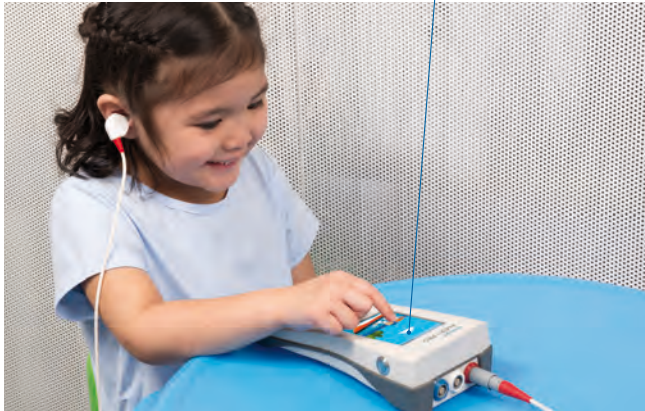
Convenient, single-touch “child mode” feature for optional OAE testing starts an entertaining animation to keep the child engaged and quiet during the test.