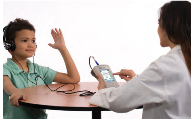
Refined audiometry features include Pure Tone audiometry to 16 kHz as well as Bone Conduction and speech audiometry (live voice and recorded).