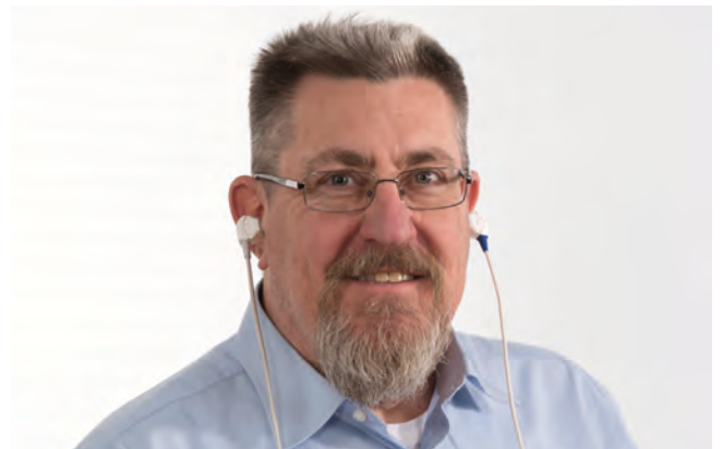
Optional second probe allows for simultaneous bilateral OAE testing.